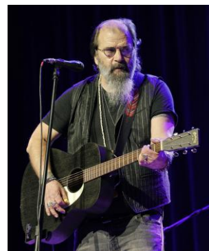
A more recent picture of Steve Earle at the Mastersons Concert.