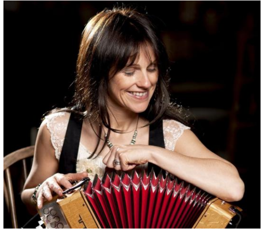
A made public image of Sharon Shannon in her earlier career.

Shannon recorded with Steve Earle on the song " The Galway Girl ", which was released on both Earle's album Transcendental Blues , and in Shannon & Friends' The Diamond Mountain Sessions . Both albums were released in 2000.