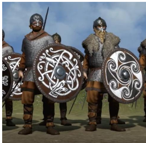
A picture showing typical Viking foot soldiers.

The Northmen, also known as “Norsemen,” began their seafaring activities in the late 8th century, with the first recorded major attack occurring in 793 at the Lindisfarne monastery off the coast of Northumberland in northeastern England. This marked the beginning of the Viking Age, which lasted until the 11th century.