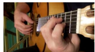
A семиструнную (семе-strynnou) 7 string gypsy guitar.