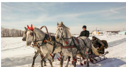
A Russian Troika . A sled pulled by three horses.

The melody was specifically composed to have a unique sound made by a seven-string, gypsy guitar which was even mentioned in the original ballad as семиструнную (семе-strynnou’). The ballad became immensely popular in over 40 countries.